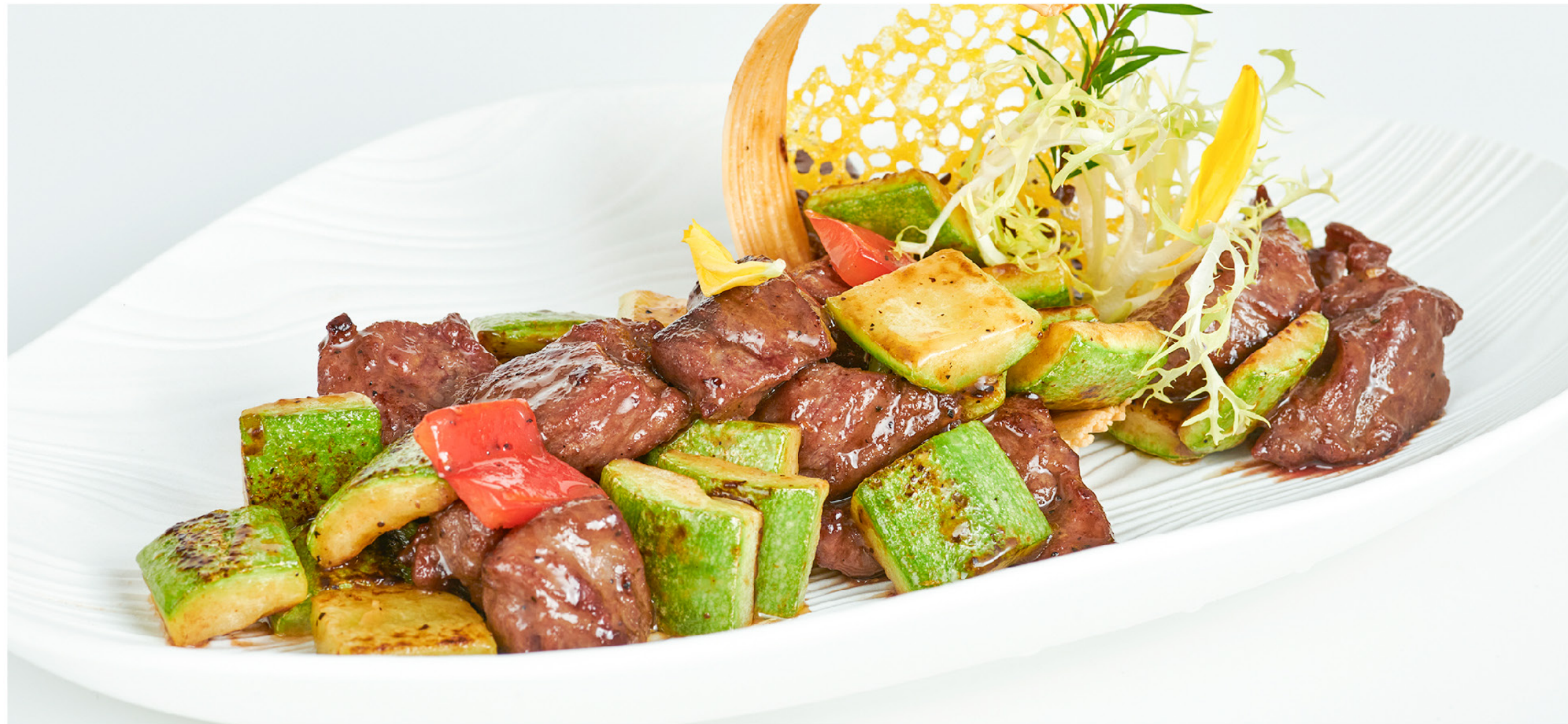
生爆澳洲牛肉眼 Wok-fried Australian Beef with Vegetables