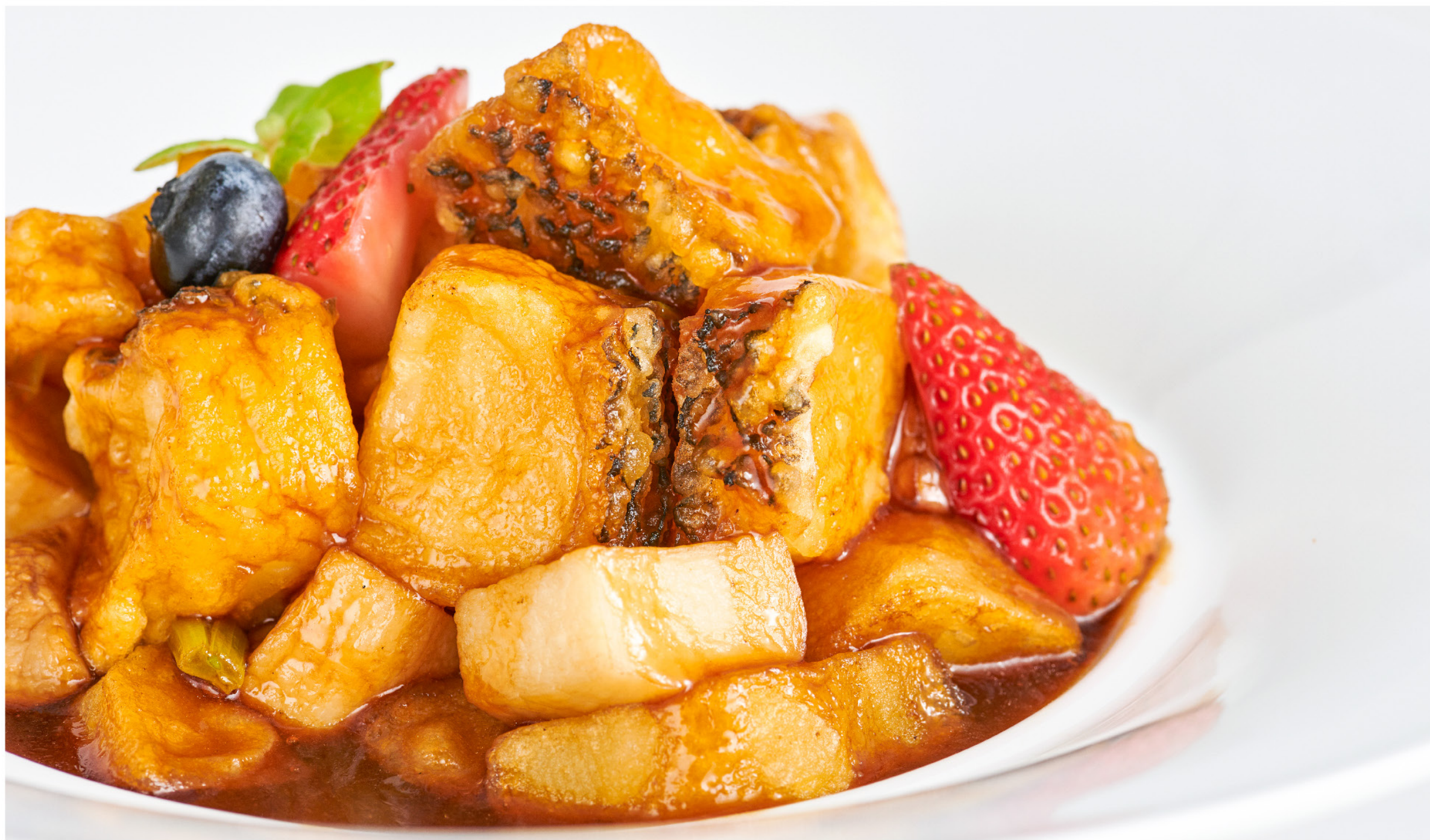
彩椒鳕鱼煲 Braised Cod Fish with Superior Sauce