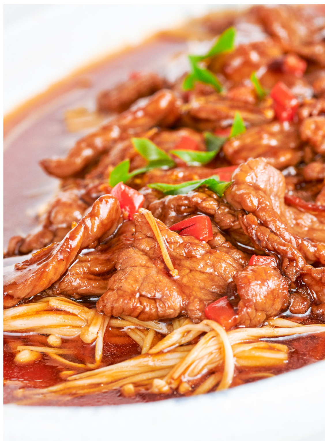
金针菇陈皮蒸牛肉 Steamed Beef with Enoki Mushrooms