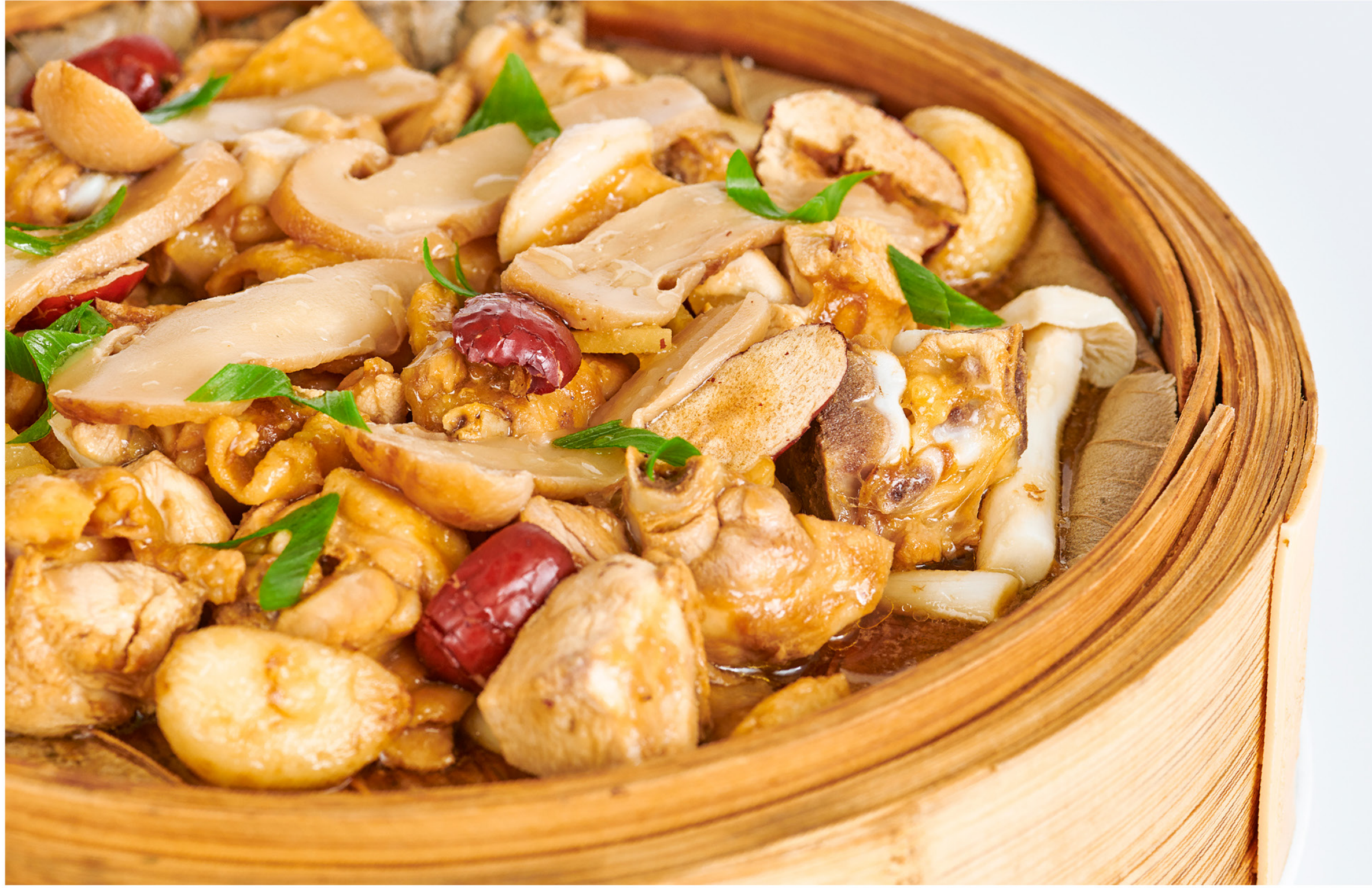
松茸红枣蒸走地鸡 Steamed Chicken with Matsutake and Red Date