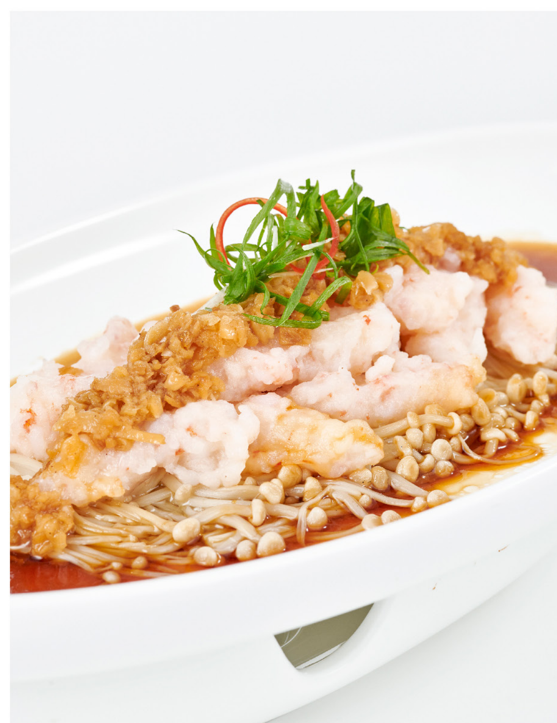
手打虾滑金针菇 Sauteed Handmade Shrimp Paste with Enoki Mushrooms