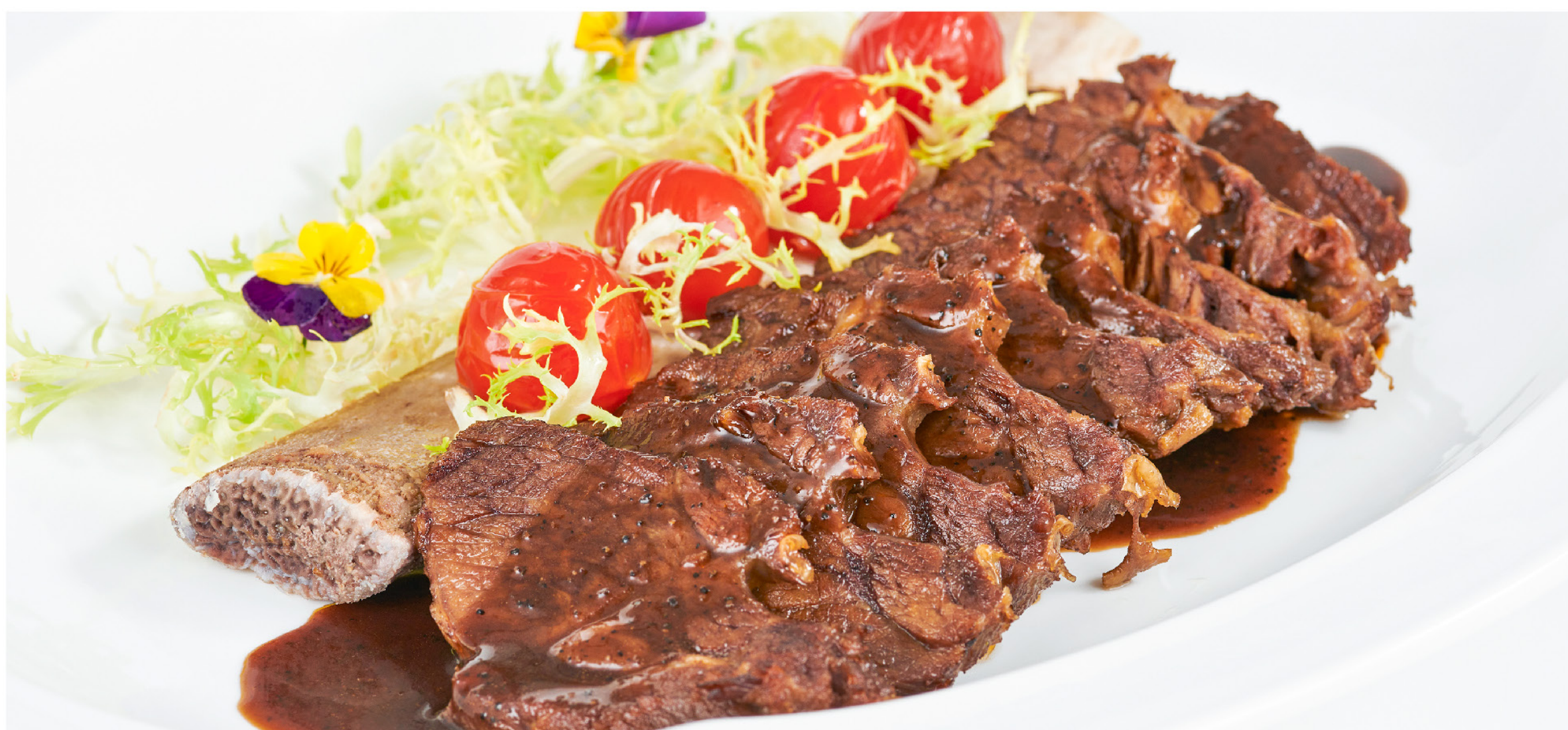
酱皇雪花牛肋骨 Braised Beef Ribs with Superior Soya Sauce