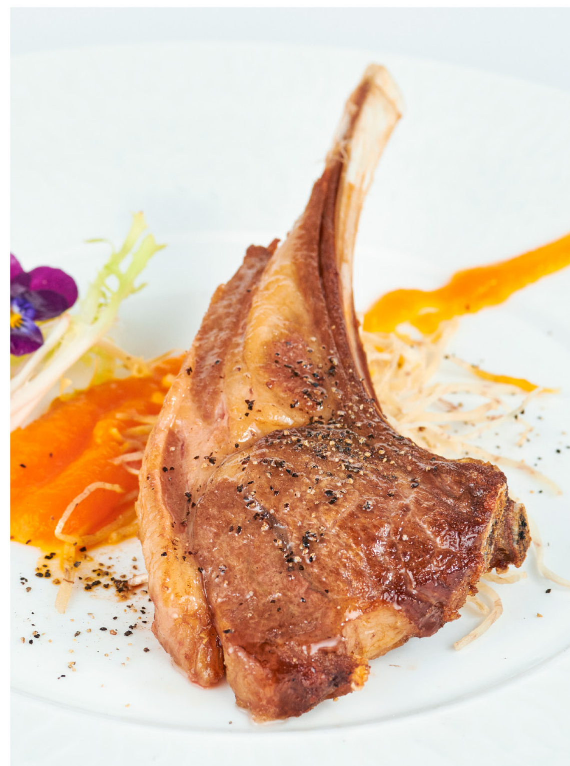
香煎羊排 Pan-fried Lamb Chop