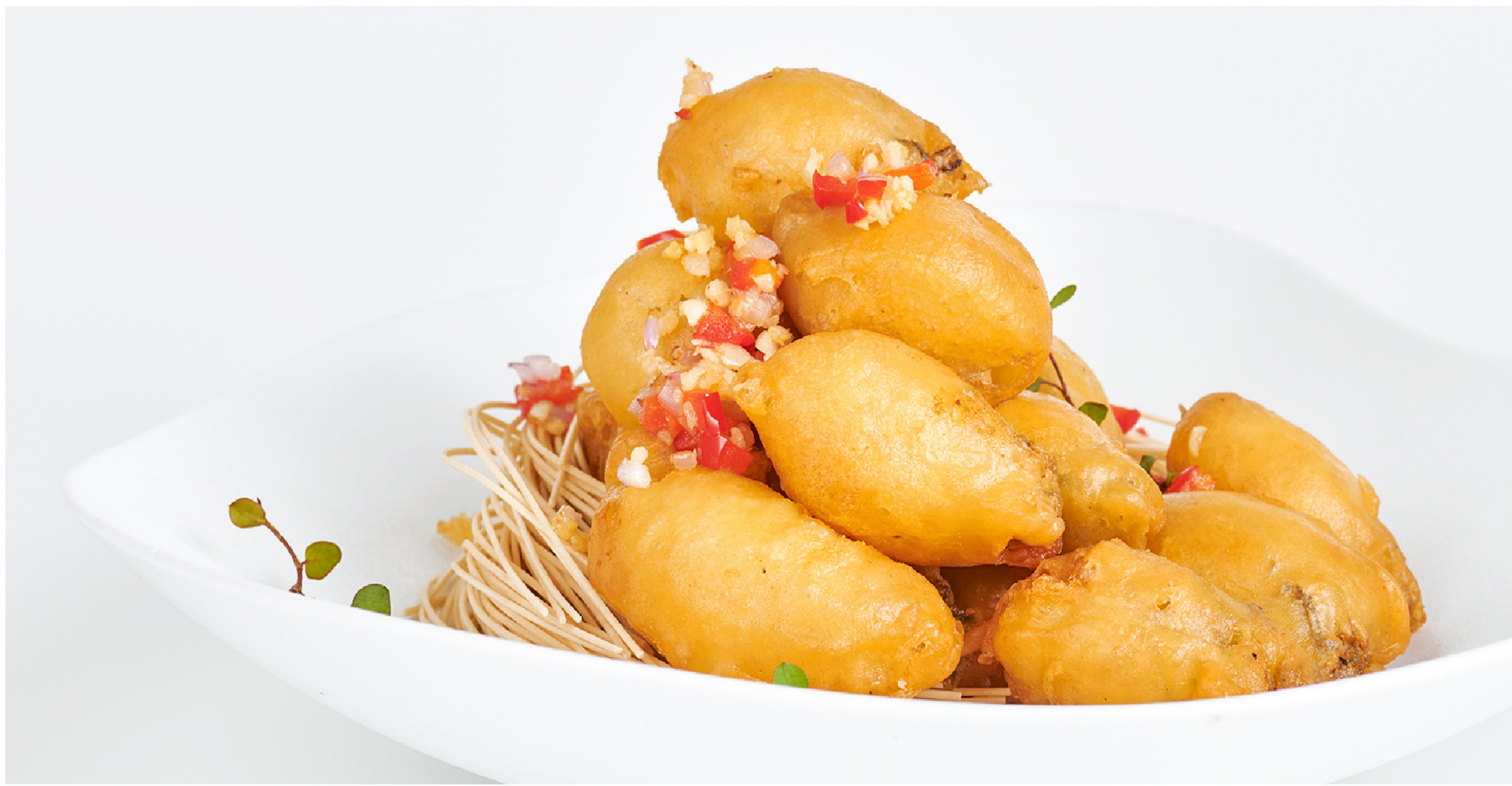
脆炸海蛎仔 Deep-fried Oyster