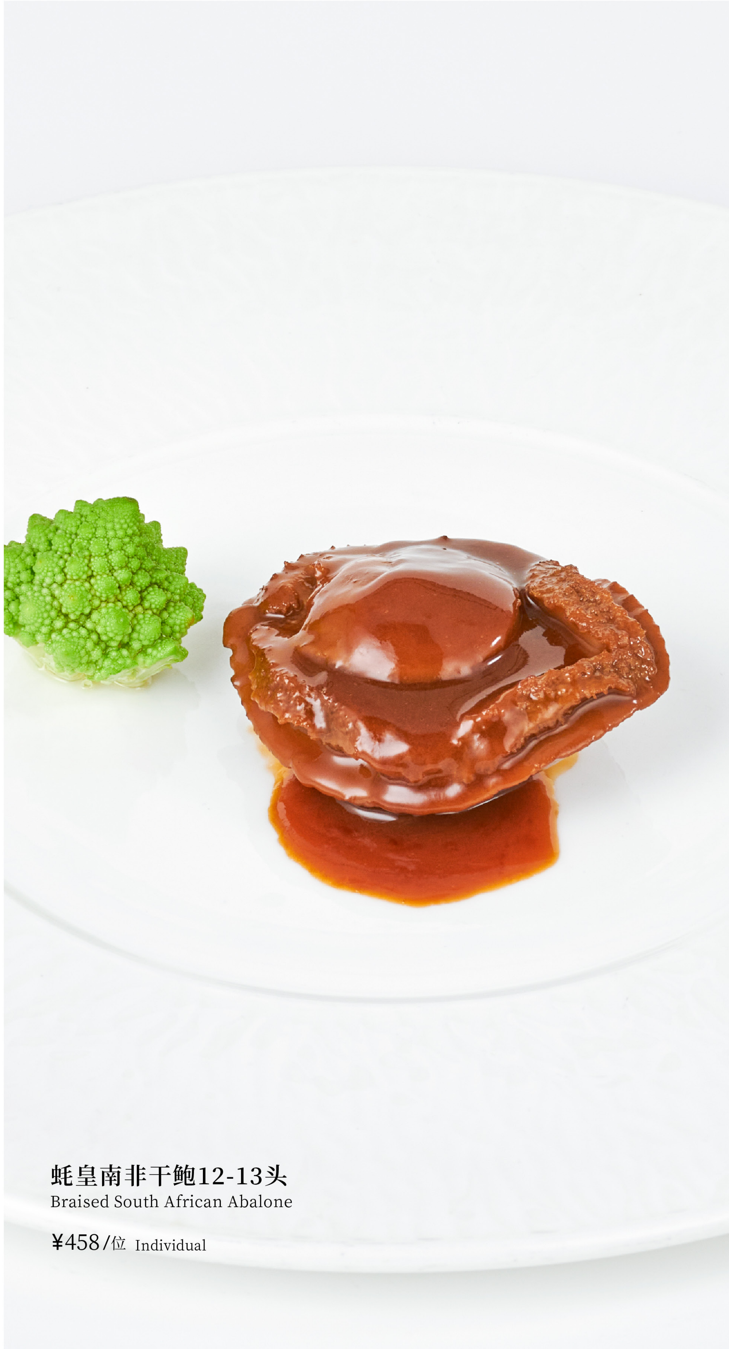
蚝皇南非干鲍12-13头 Braised South African Abalone