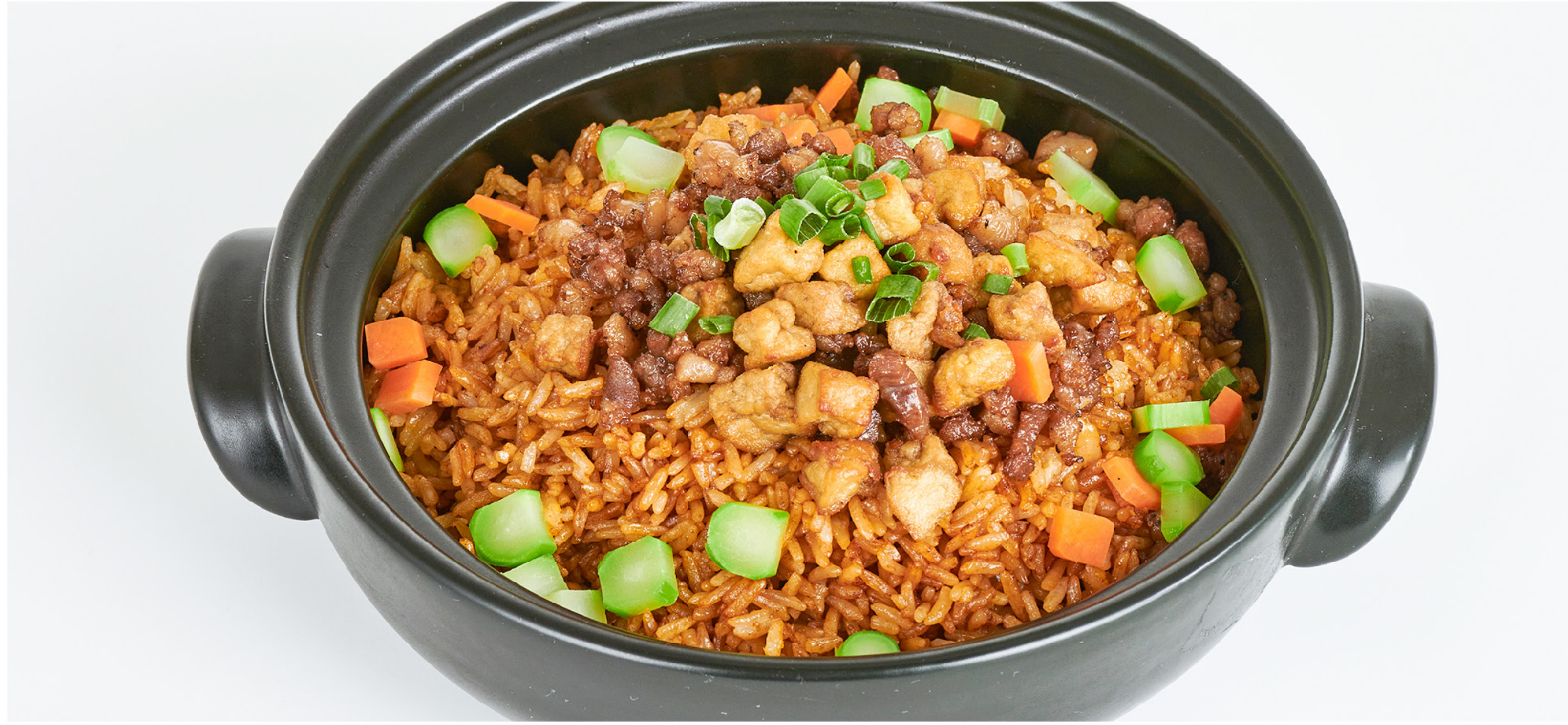
法式鹅肝牛肉炒饭 Fried Rice with Goose Liver and Beef