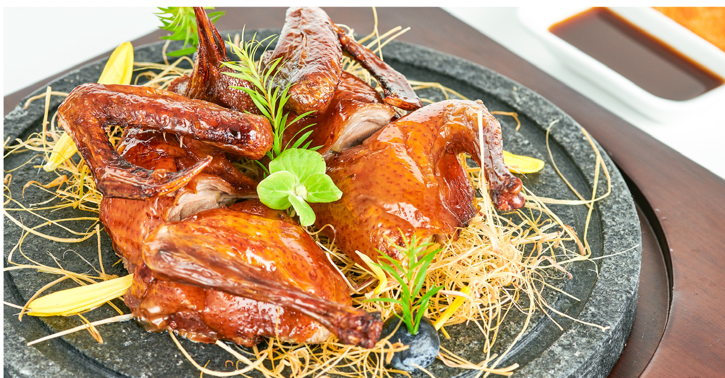
明炉烤乳鸽 Roasted Pigeon