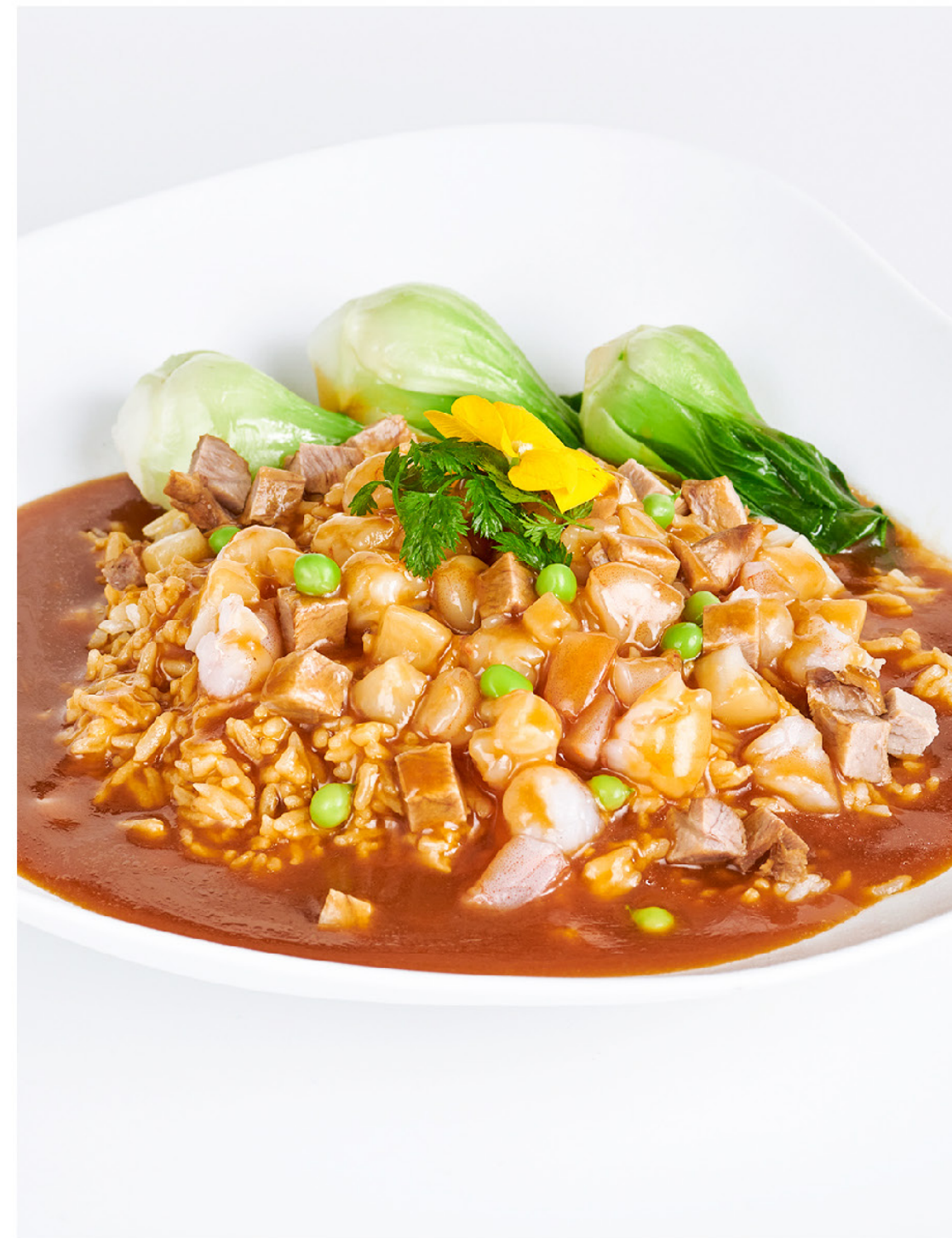
福建海皇烩饭 Fujian Fried Rice Topped with Seafood Sauce