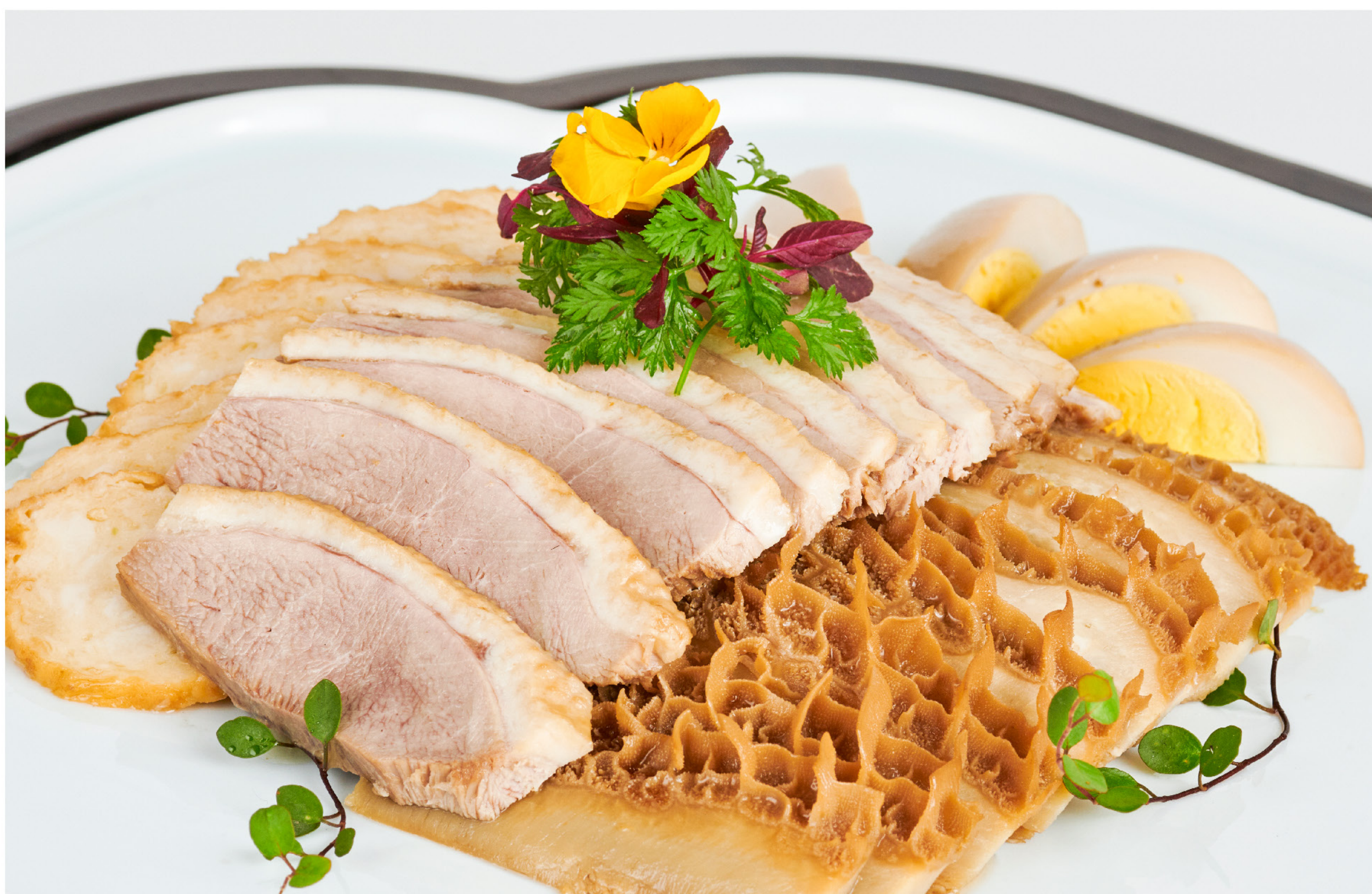
潮州卤水拼盘 Chaozhou Marinated Meat Platter