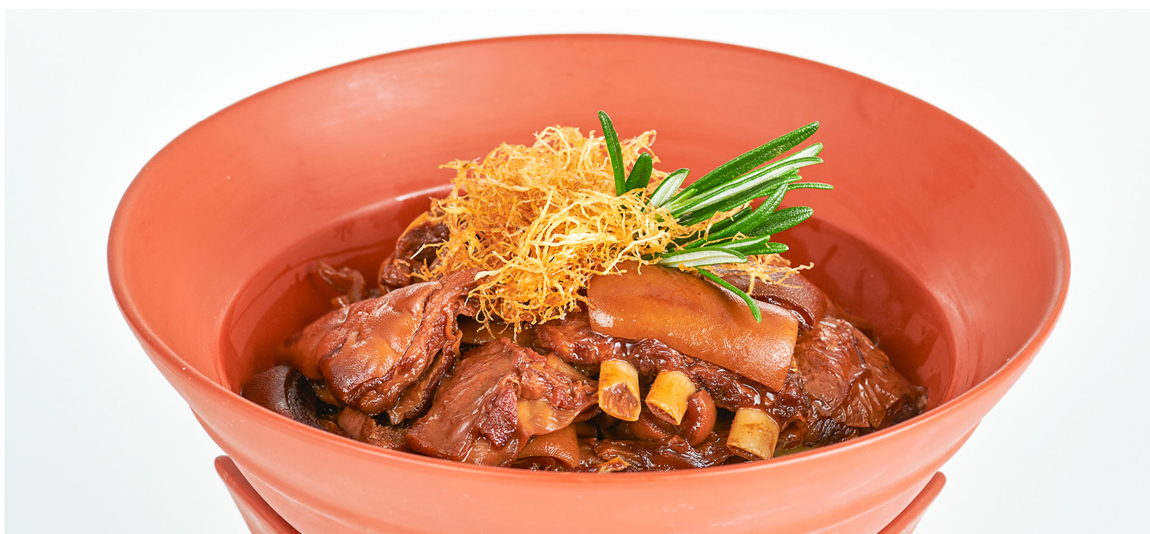
麻油焖黑山羊 Braised Black Mutton with Sesame Oil