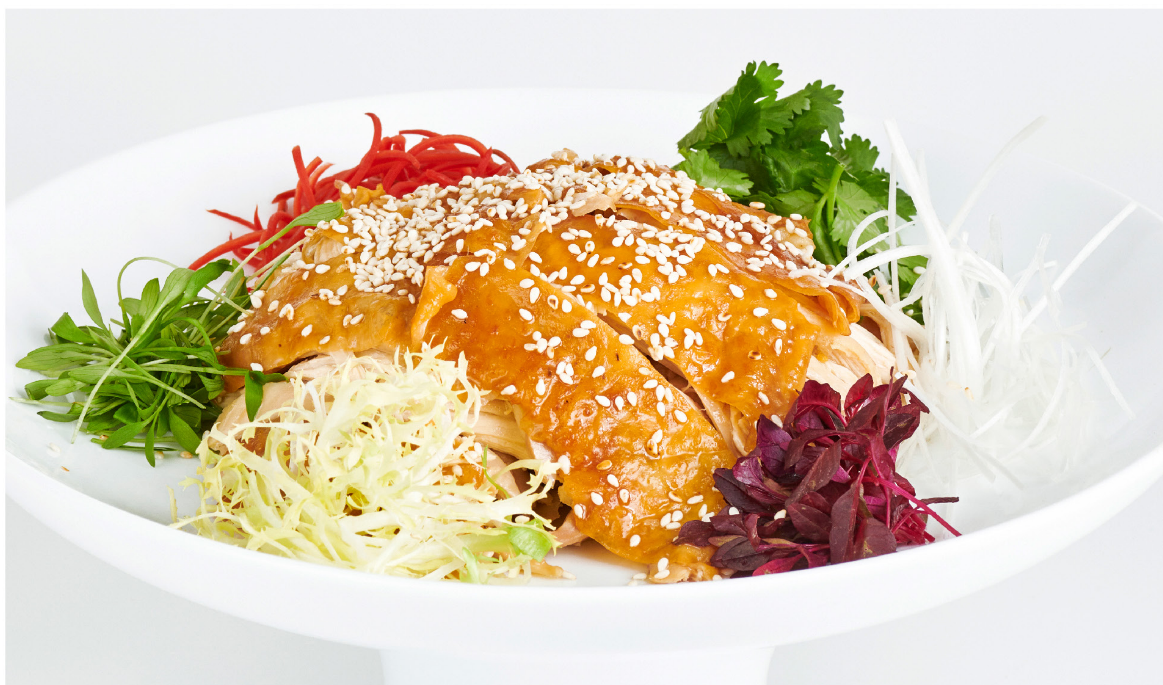
手撕鸡 Baked Salted Shredded Chicken