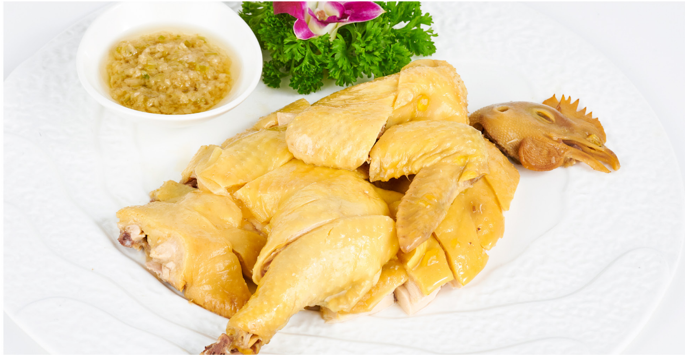
广式白切清远鸡 Cantonese Poached Chicken with Ginger Sauce