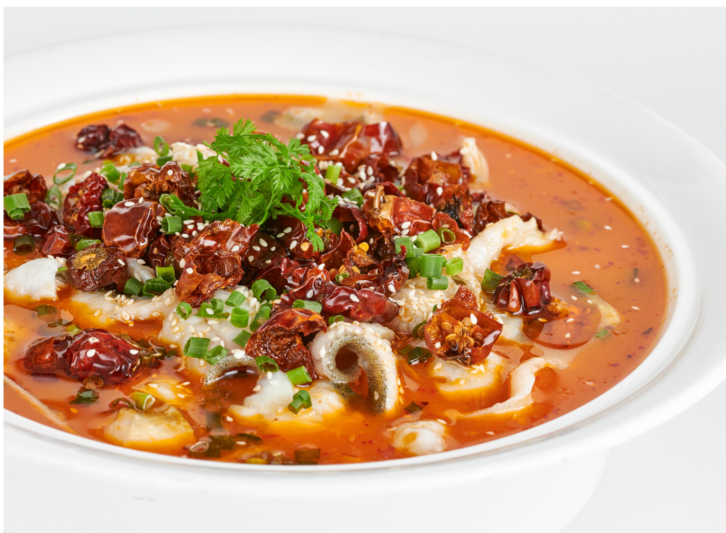
桂花鱼 Mandarin Fish

清蒸 / 川味水煮 Steamed with Soya Sauce or Poached with Spicy Broth