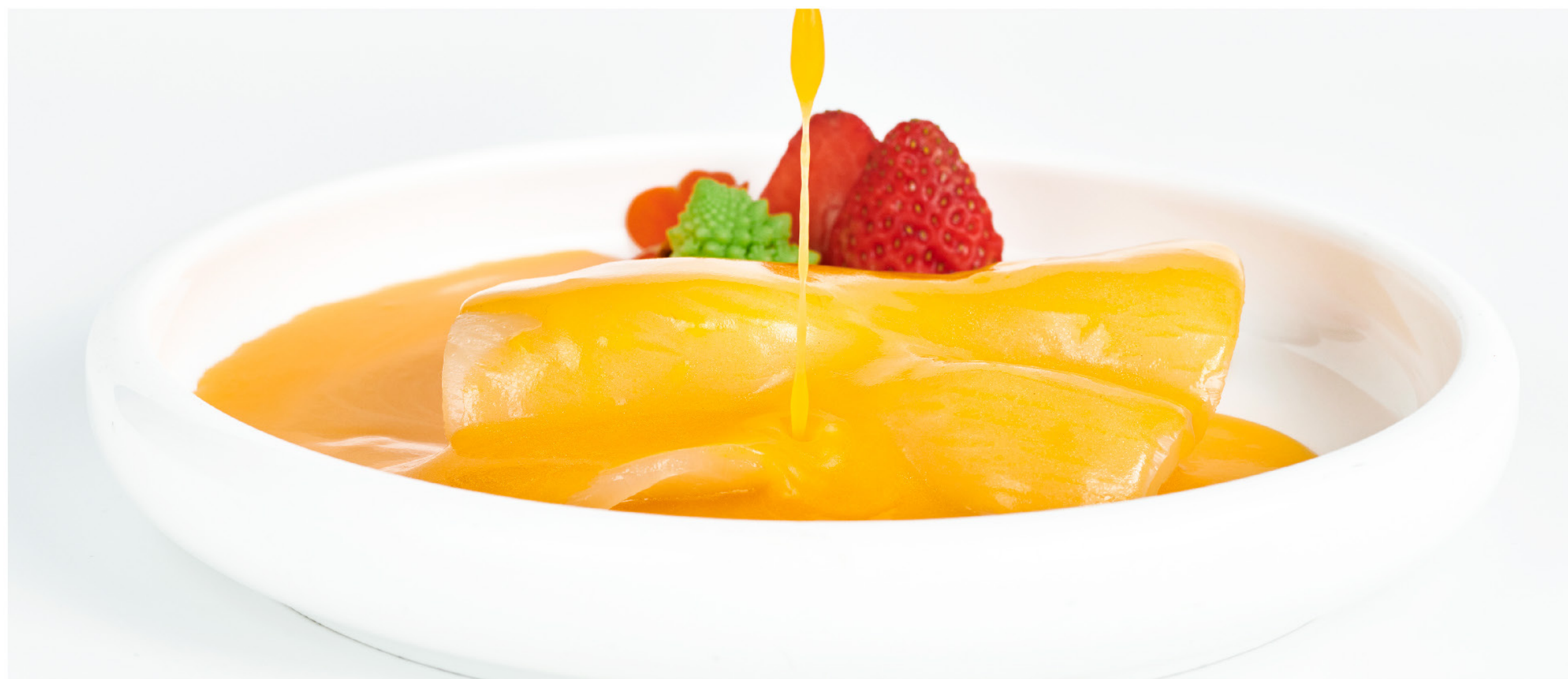
黄焖大花胶公 Braised Fish Maw with Pumpkim Sauce