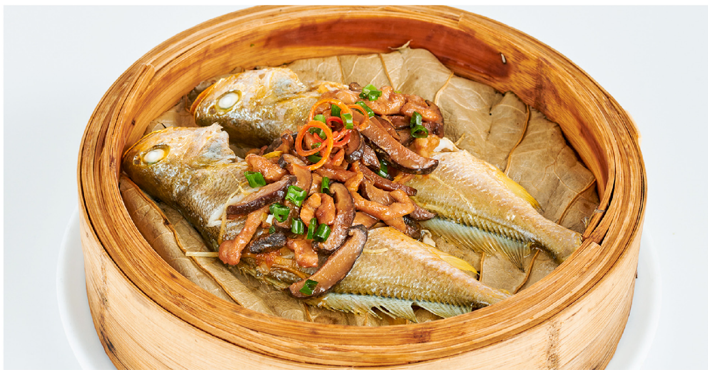
古法荷叶蒸小黄鱼 Steamed Yellow Croaker in Lotus Leaf