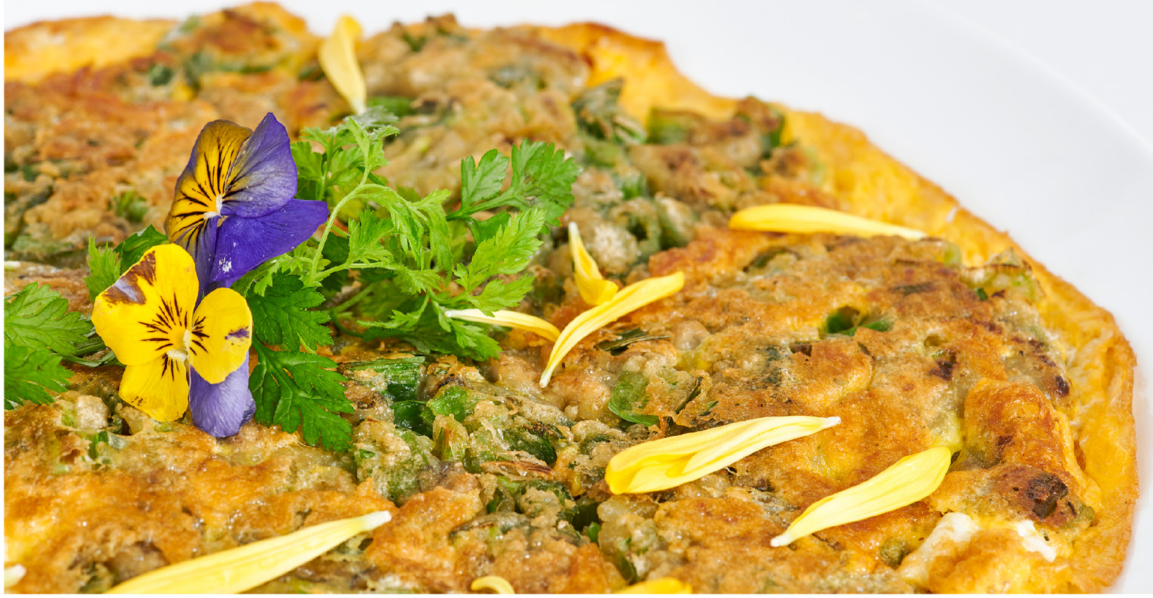
闽南海蛎煎 Minnan Oyster Pancake