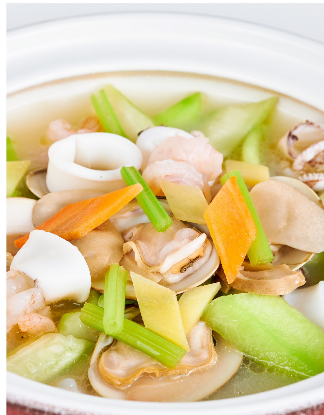
海味丝瓜煲 Braised Seafood with Luffa