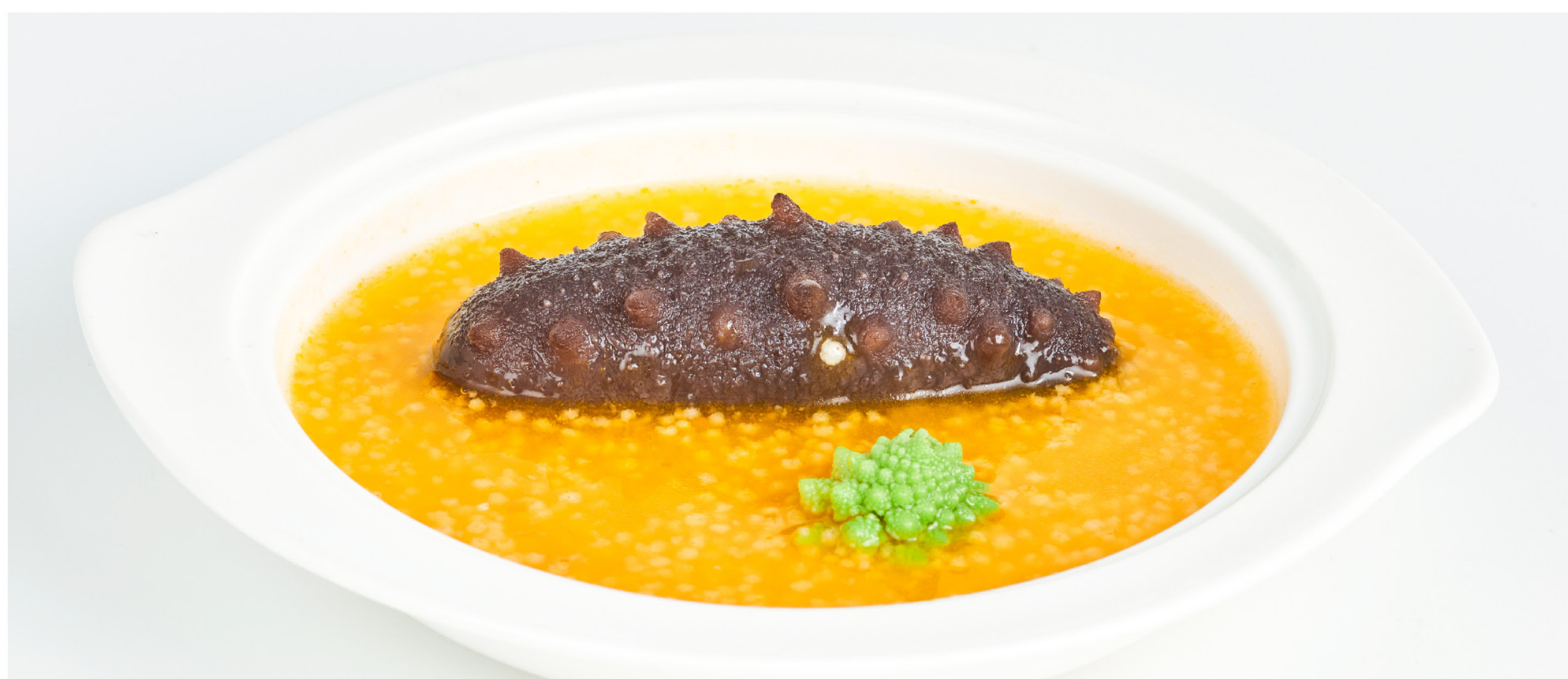
辽参 (金汤小米, 鲍汁, 五谷杂粮) Sea Cucumber Millet, Abalone Sauce, Mixed Grain