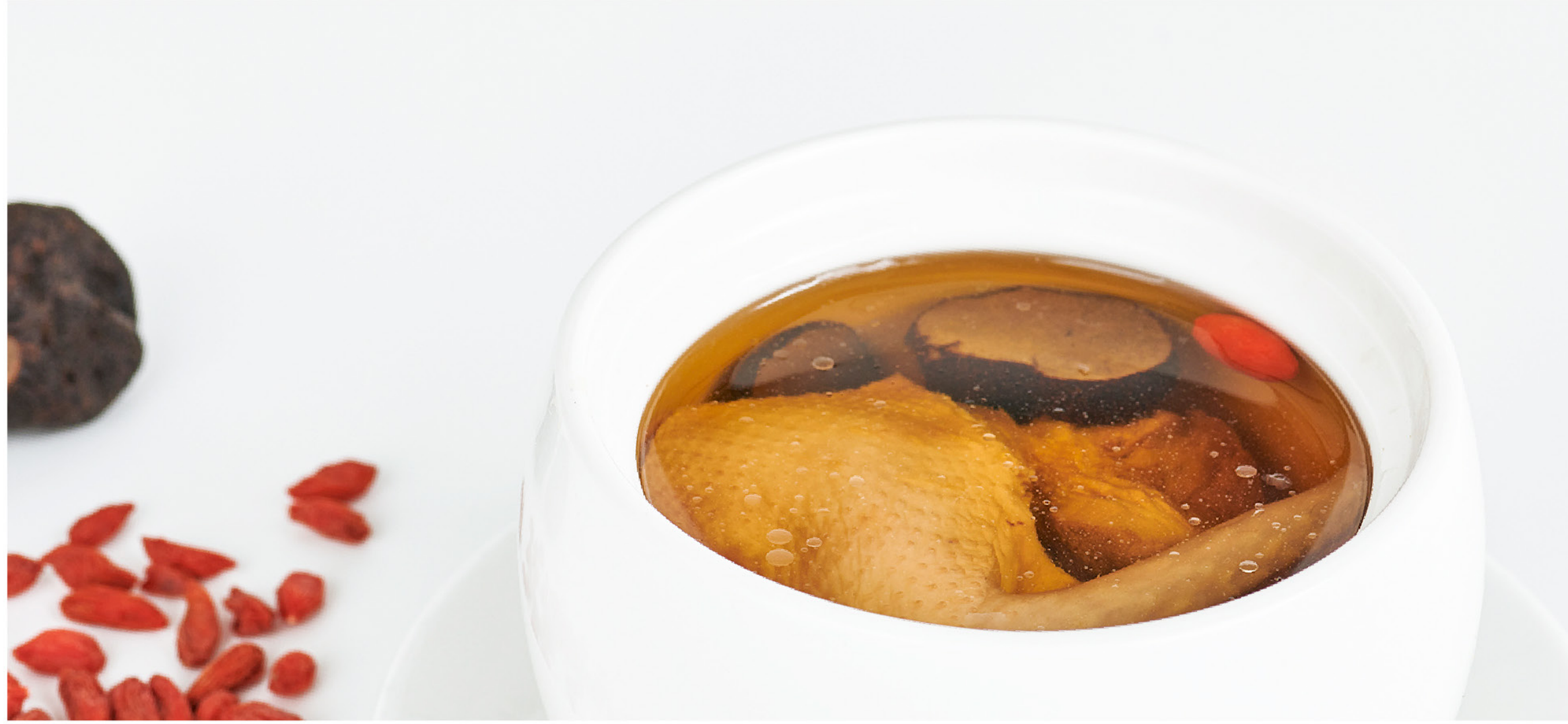
清提干黑松露炖乳鸽 Double-boiled Pigeon Soup with Black Truffle