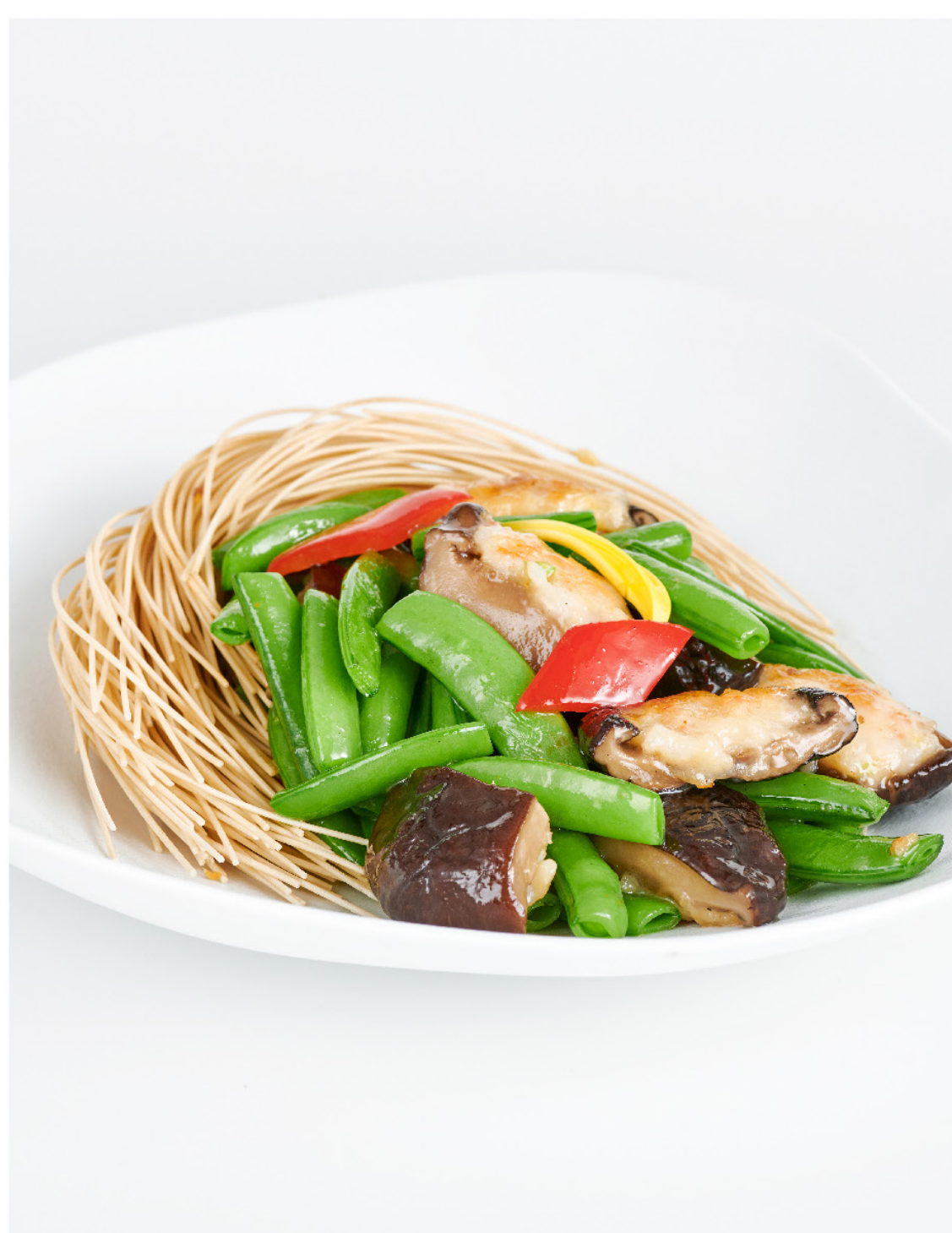
顺德碧绿炒鱼蓉酿鲜菌 Wok-fried Fish Cake, Mushroom and Vegetables