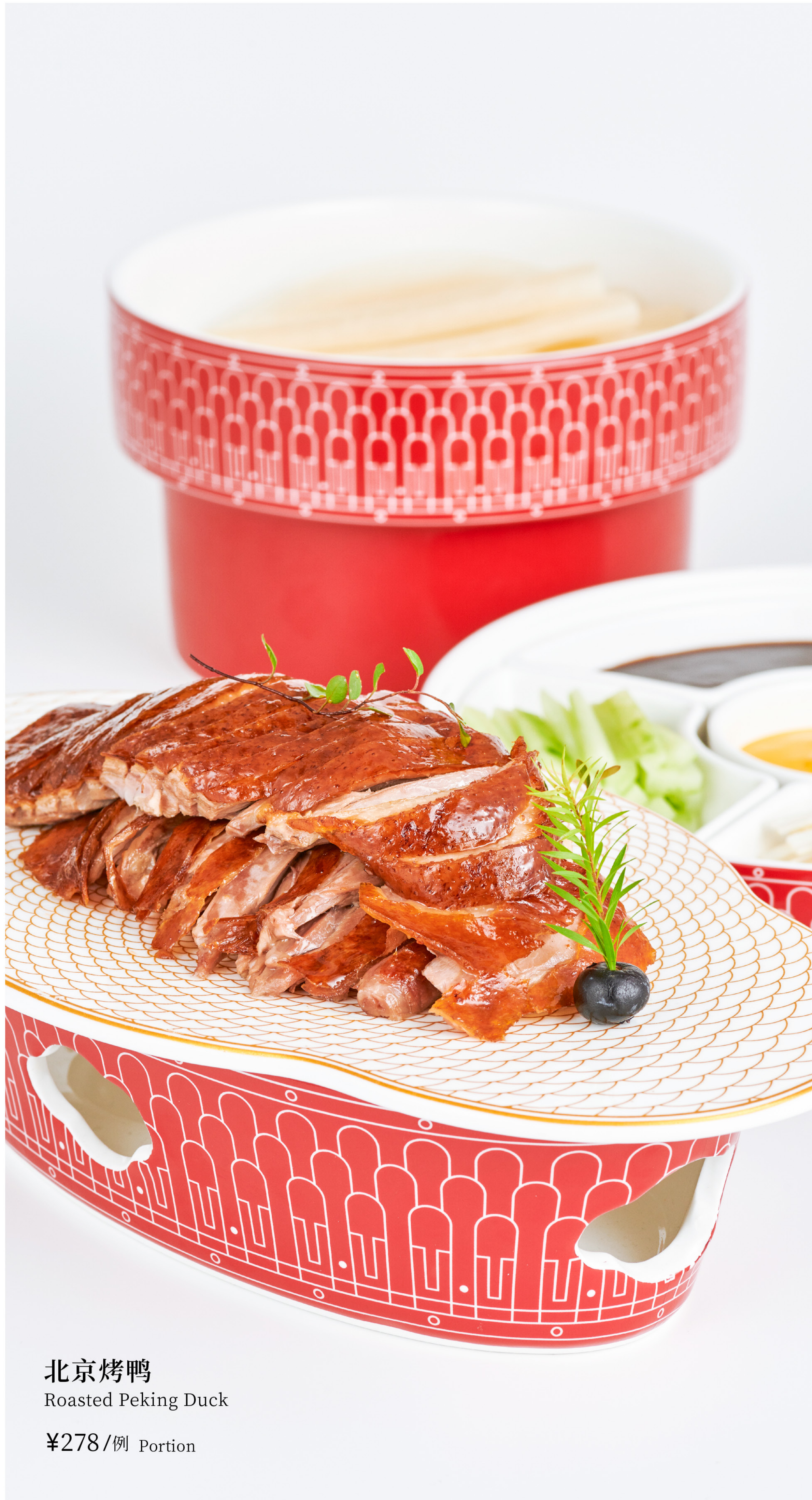
北京烤鸭 Roasted Peking Duck