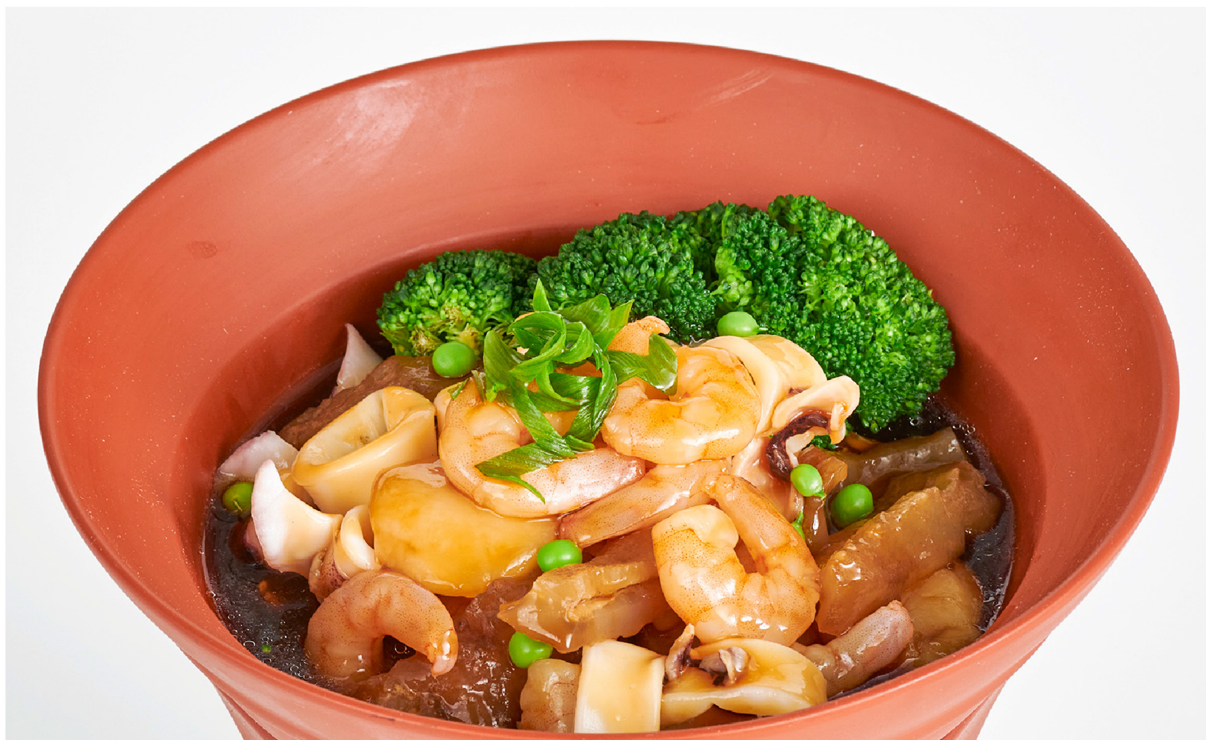
海皇一品煲 Braised Seafood with Superior Sauce