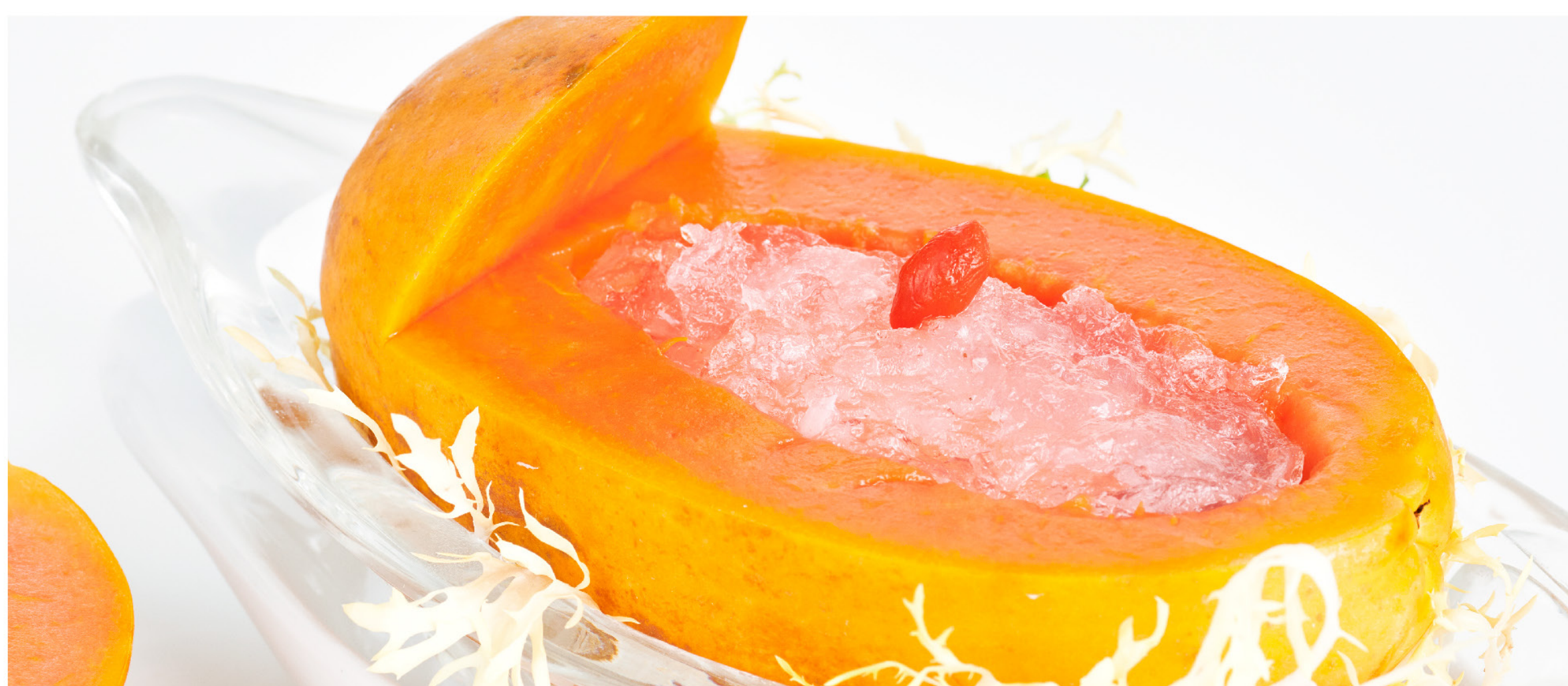
木瓜炖燕窝 Double-boiled Bird Nest with Papaya