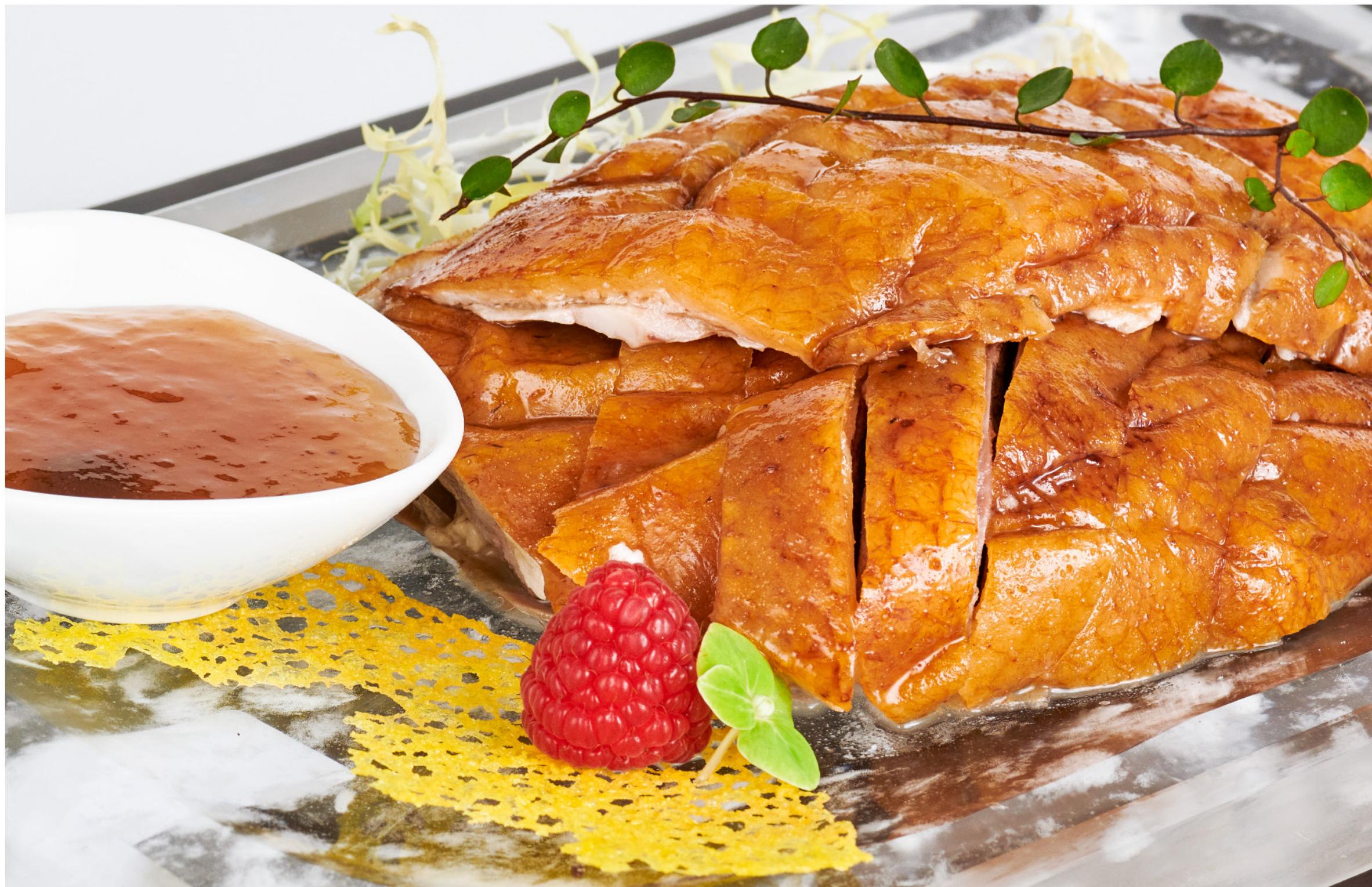
深井烧鹅 Roasted Goose