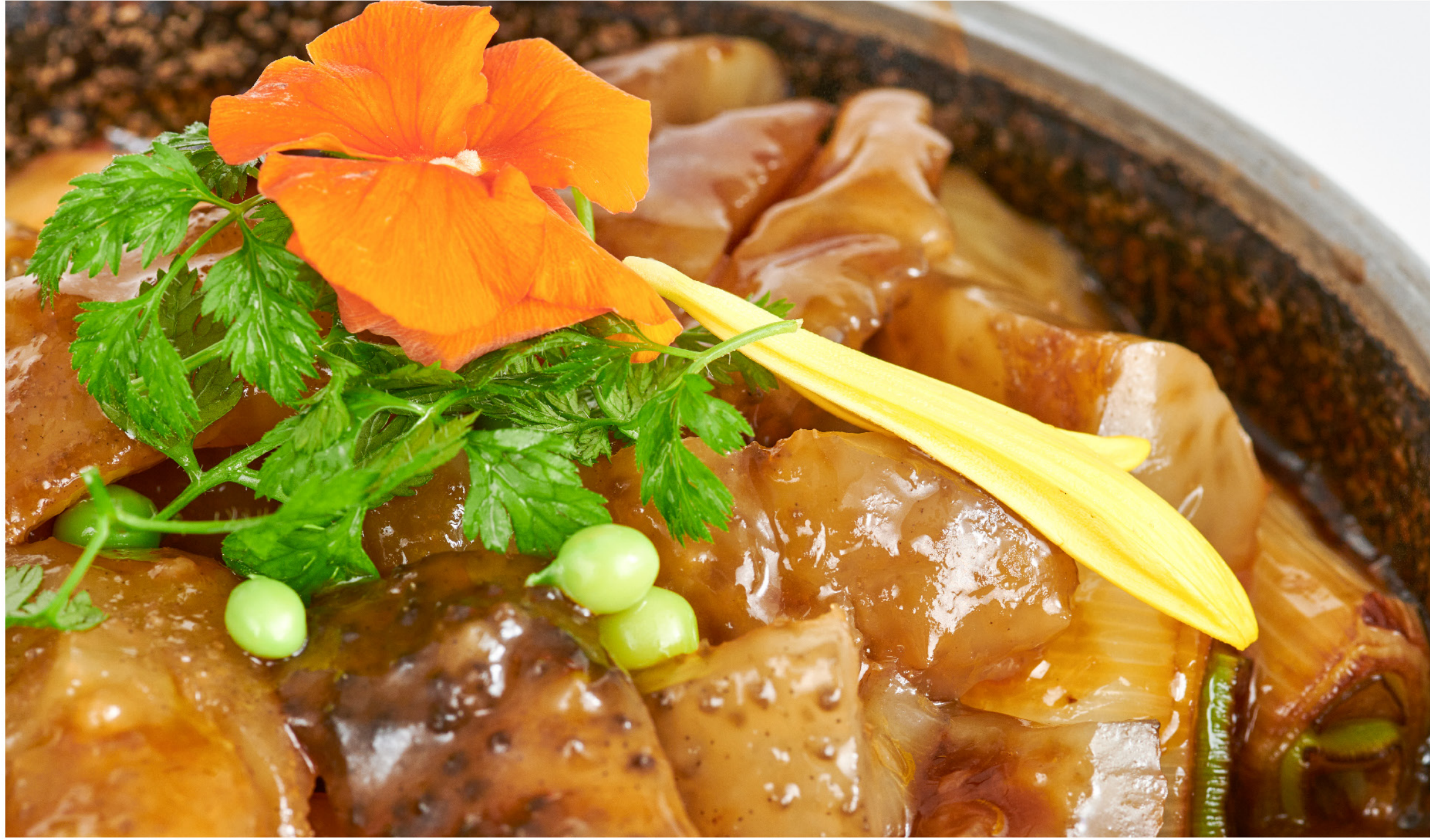
石锅葱烧海参 Braised Sea Cucumber with Leek