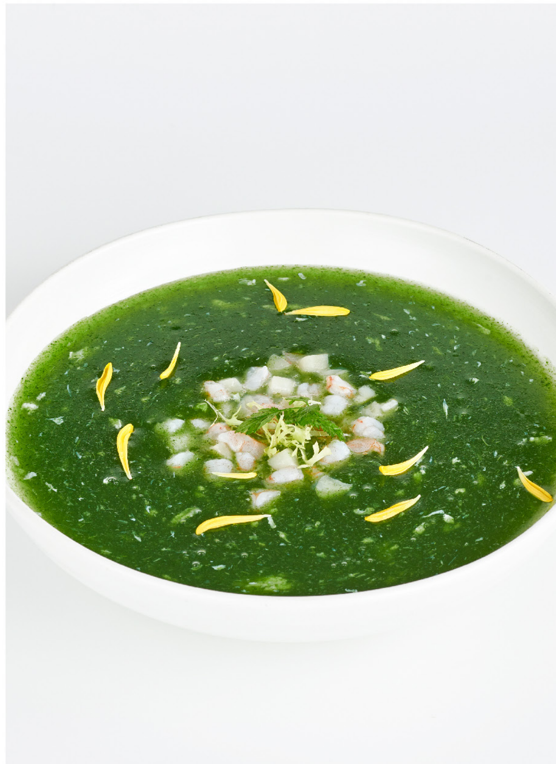
海鲜菠菜羹 Seafood Spinach Soup